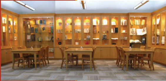
The Herron Art Library, at the Herron School of Art and Design